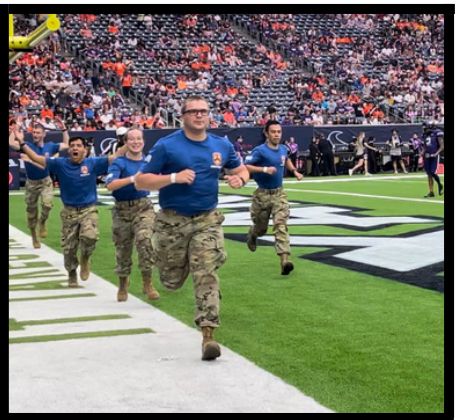
Push-up crew is an excellent opportunity for cadets to become more active in the program. When there is a game, the push-up crew cheers on and supports the players by doing push-ups for every touchdown they score.