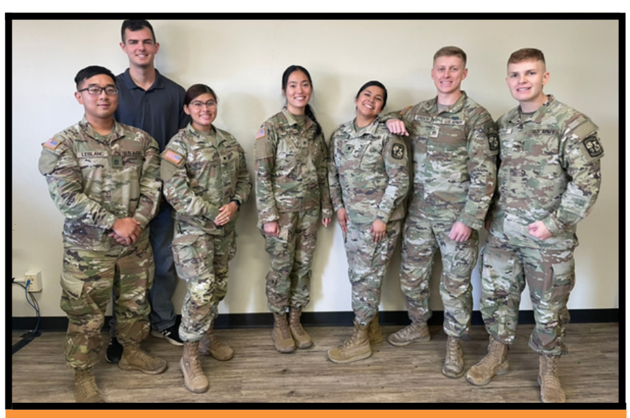
These are just a few of our SMP Cadets.