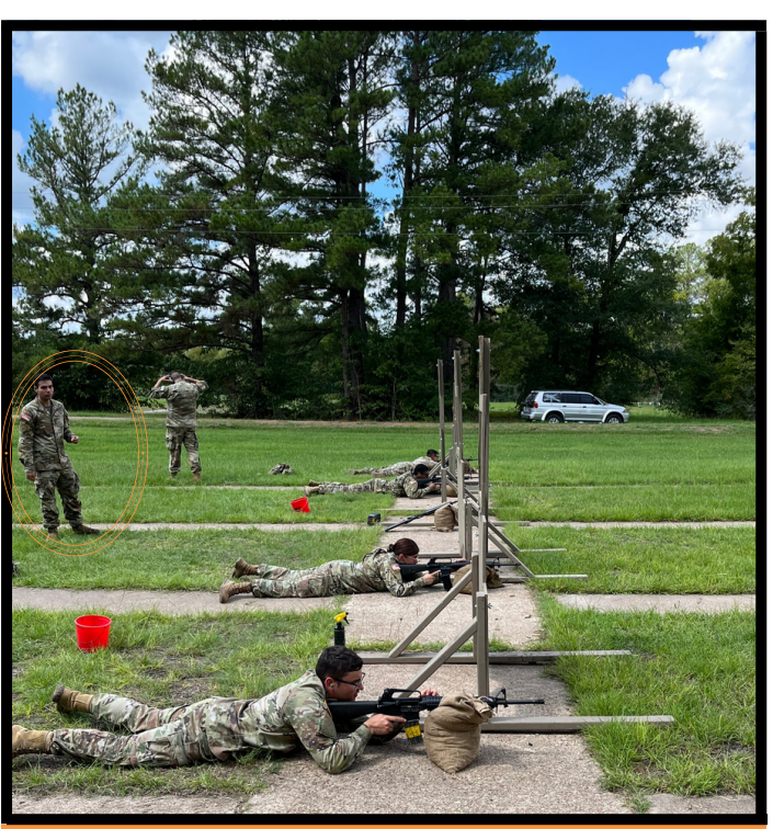
CDT Pilgrim leading the BRM training at the Huntsville Police Department Range.